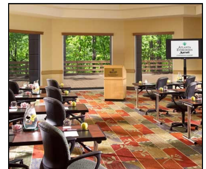
The Evergreen Conference Center is an attractive and secluded business retreat.